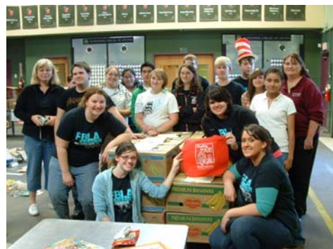
A wonderful and talented team of Future Business Leaders of America from Silverton came to the Marion Polk Food Share to sort books that will go back out into the community!